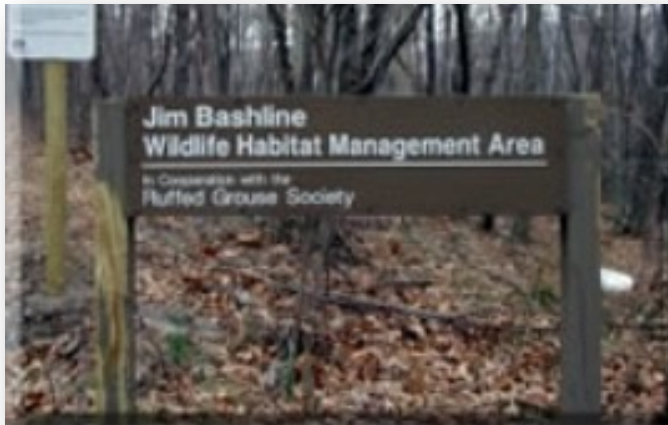
Raystown/Ruffed Grouse Society WMA

However, if the potential partner requests a local MOU as a condition to partner with the Corps, you may use the National MOU as a model example to create a local version.