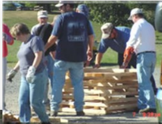
Tioga-Hammond/PA Fish & Boat Commission Fish Habitat Improvements